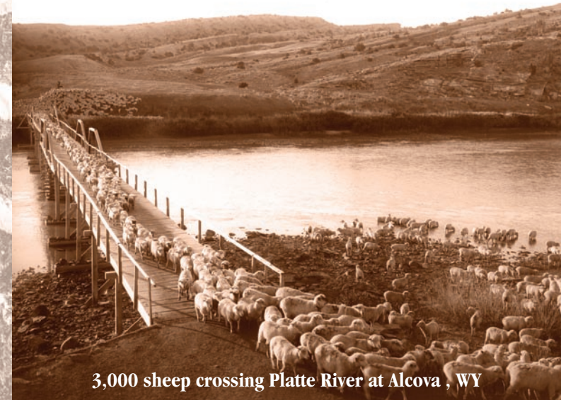
3,000 sheep crossing Platte River at Alcova, WY