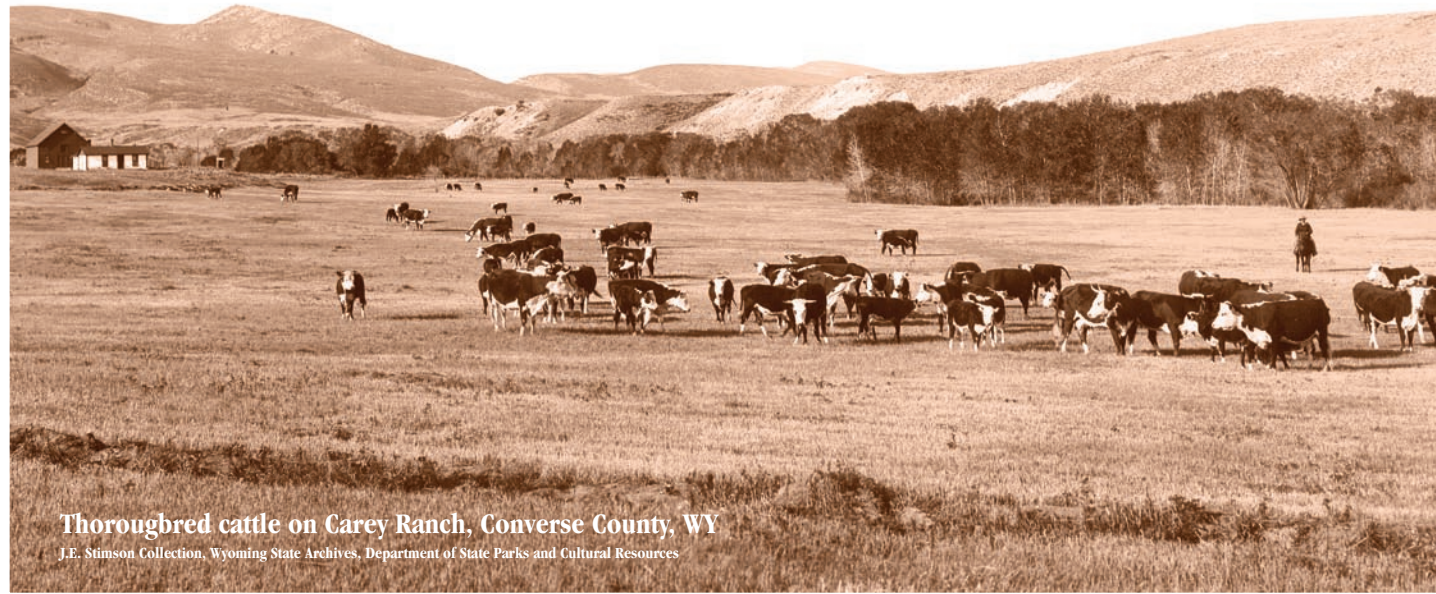
Thoroughbred cattle on Carey Ranch, Converse County, WY

Wyoming's ranch and farmlands are disappearing at an alarming rate. Farmers and ranchers have withstood development pressure, drought, and mining threats and yet they have managed to preserve these important pieces of Wyoming's rural heritage. Agriculture produces more than food; it also maintains open spaces, contributes to the state's economy, and supports family businesses. These ranches and farms are not just history but remain vital today and highlight the importance of agriculture to Wyoming.